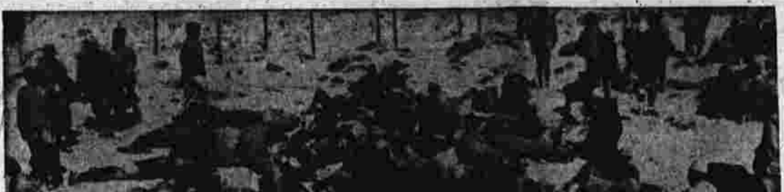
Axis Prisoners Taken in New African Drive. Here are some Axis prisoners, led by the British as they pushed westward in pursuit of Marshal Erwin Rommel's army. Troops captured by the British were officially estimated at well in excess of 60,000, many of them Italians.

Cairo, Nov. 14.—(AP)—Long-range Allied fighter planes shot down about 70 Axis aircraft out of a formation of about 60 speeding from North Africa toward Sicily yesterday as the British Eighth Army cleared eastern Libya of Field Marshal Erwin Rommel's army to a point 40 miles west of Tobruk.